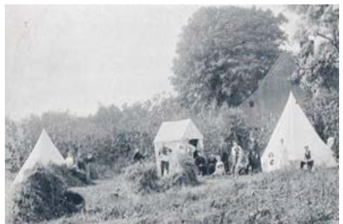
THE SOCIALIST CAMP, CAISTER-ON-SEA.